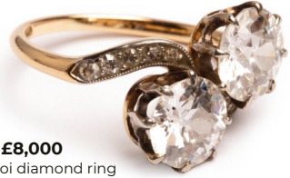
Sold for £8,000 A Toi et Moi diamond ring

CHORLEY'S AUCTIONEERS Cotswolds Heritage since 1862