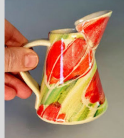
Functional and unique ceramics.

Ceramics for the home, made by hand in Uley. Free delivery for Uley and 3 mile radius. Order from website and select 'collect' option and message me your address / collect your purchase from me at 9 Green Close. Shipping and gift wrap available.